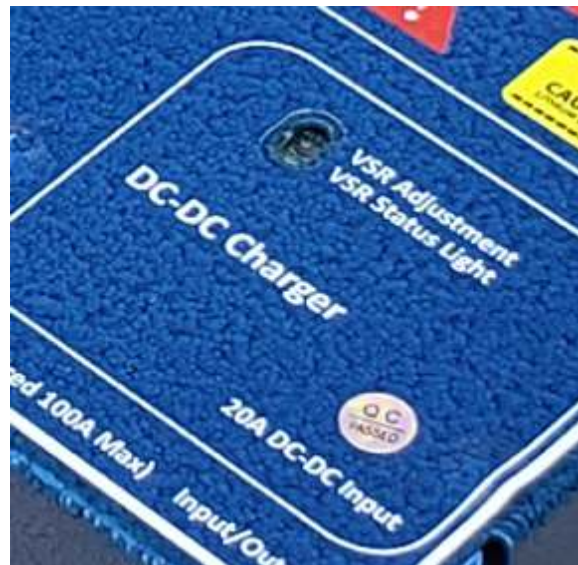
Figure 5 – DC-DC Charging Terminal Connections

Note that the voltage sensed by the DC-DC charger when it is charging, will be slightly different to the voltage measured at the vehicle alternator / start battery. This is because of the voltage drop along the cable from the alternator / start battery to the LBS battery. If this voltage drop is too high, a thicker and/or shorter cable may be required.