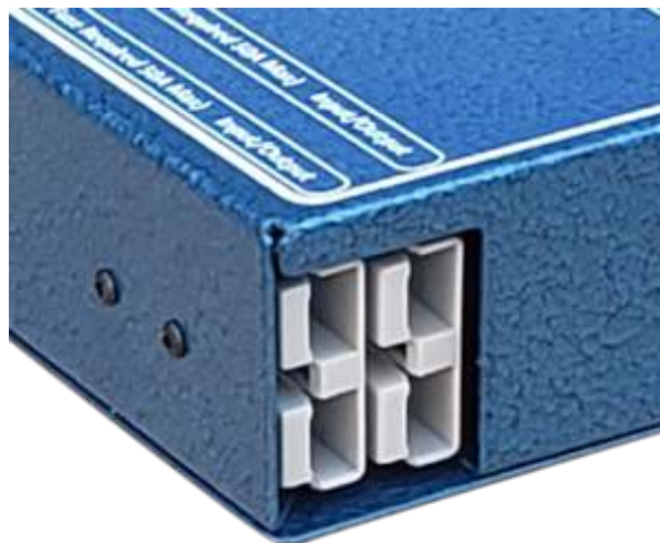
Figure 3 – Dual Grey Anderson Plugs

For connected chargers and devices, a grey Anderson plug must be used. Check to ensure the Anderson is correctly wired (positive and negative) and do not attempt to use any coloured Anderson other than grey.