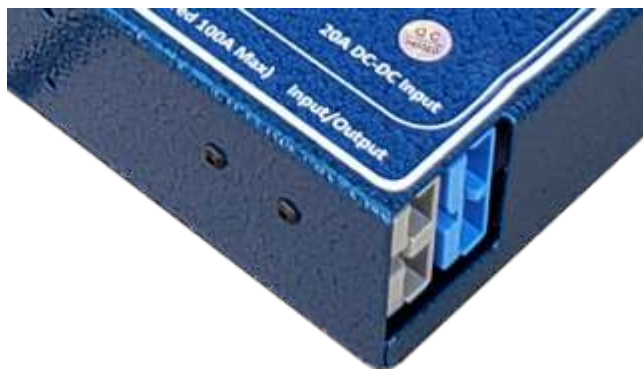
Figure 4 – DCS Model Anderson Connectors

The blue connector is reserved for a DC input, to make use of the internal DC-DC charger. The DC-DC charger is rated for 20A input from a vehicle alternator or start battery.