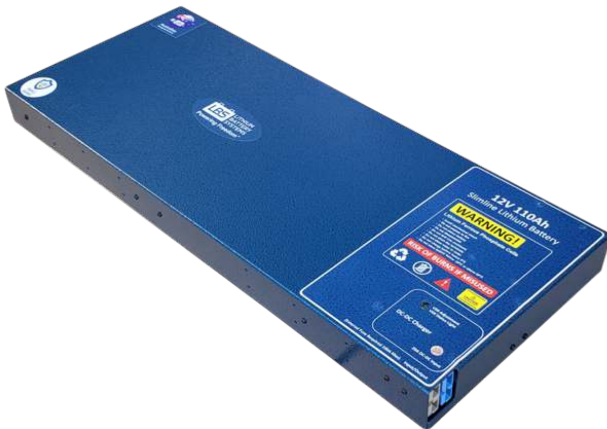
Figure 1 – Slimline Battery (DCS model)

As with all batteries, you should consider the mechanical and environmental conditions that you intend to operate the battery in to maximise overall performance and achieve the longest battery life. LBS offer these general guidelines; however, you should seek LBS advice or that of a qualified electrical tradesperson if you are in doubt.