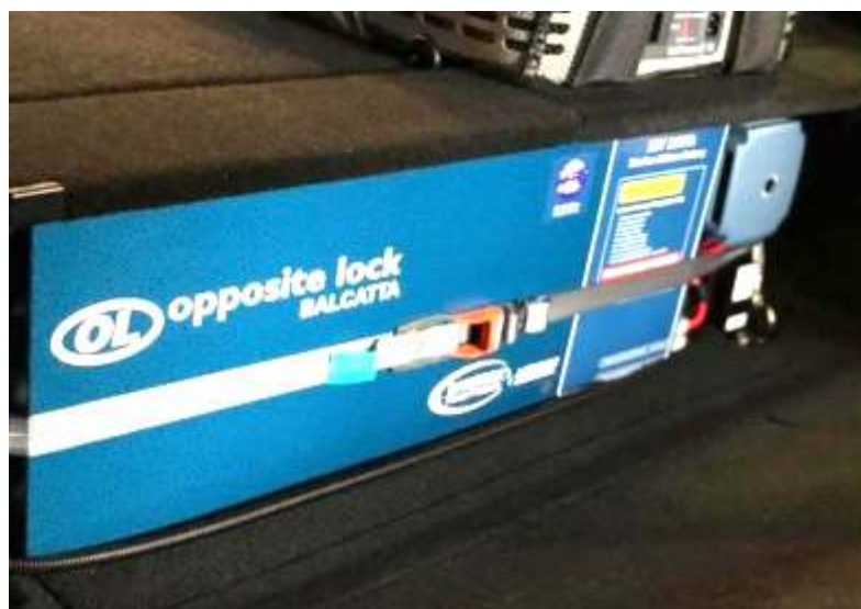
Figure 2c – Strapped at the back of a 4x4

As with all battery installations, ensure it is securely strapped down or secured in place before heading out on the road.