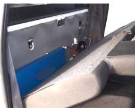
Figure 2a – Behind a seat

Figure 2 illustrates some handy stowage solutions. The primary benefit of the slim battery is that it can tuck away behind or under a seat in a vehicle. Too often space is at a premium and the slim shape and design of the battery means it can be hidden away.