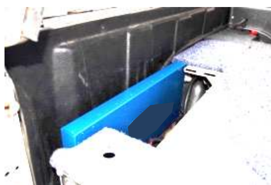
Figure 2b – Back of a 4x4