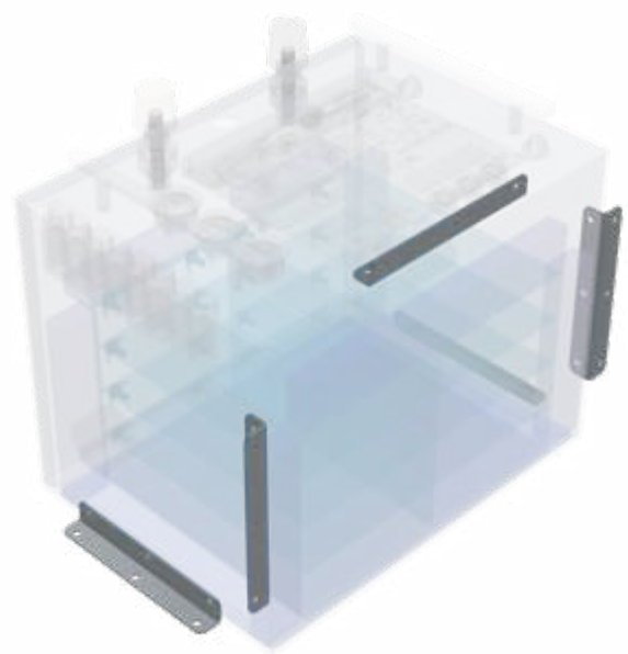
Mounting Bracket Options