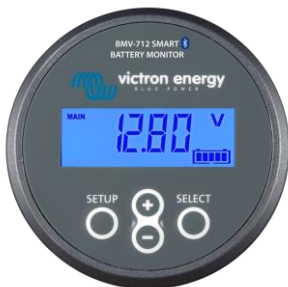
Victron Monitoring Screen